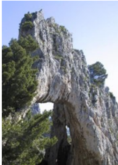
Capri – L'Arco Naturale