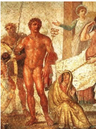
House of the Vettii

The House of the Faun is one of the most beautiful examples of a private house in the ancient world because of its size, the elegance of its architecture and the splendid mosaics. House of the Vettii is the most admired; it is full of very well preserved paintings, statues, decorations and wonderful rooms. Villa dei Misteri , a large construction (55 rooms), is also famous because of its beautiful paintings inspired by the Dionysiac rites that took place there.