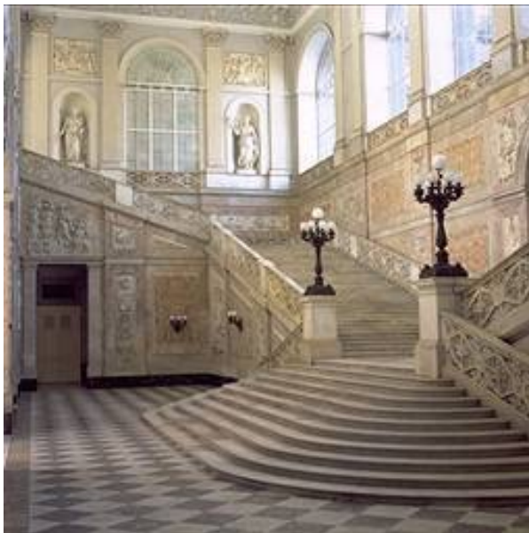
Royal Palace (interior)

The famous sentence “ Vedi Napoli e poi muori ” ( See Naples and die) was coined during the Kingdom of the Bourbon dynasty, a period generally considered the golden age of Naples. The kingdom, called “Il Regno delle due Sicilie ” was the richest and the most industrialized of all Italian states till it became part of the Kingdom of Italy. After London and Paris, Naples was the most densely populated town in Europe and also one of the wealthiest. Nowadays a tour of Naples is not considered exhaustive without a visit to Palazzo Reale, to the Reggia di Capodimonte and to the three Castles which in ancient times were used to protect the country. They are Maschio Angioino, Castel dell'Ovo and Castel Sant'Elmo.