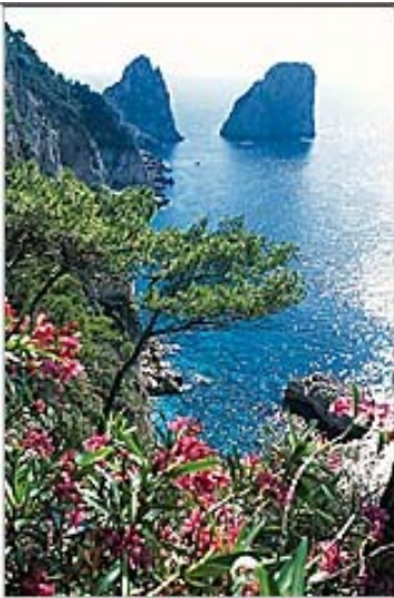
Capri – I Faraglioni

Also Marina Piccola is very charming as well as the Natural Arch and Anacapri , from where you can reach Mount Solaro by chair-lift, and finally the Villa Museum of S. Michele