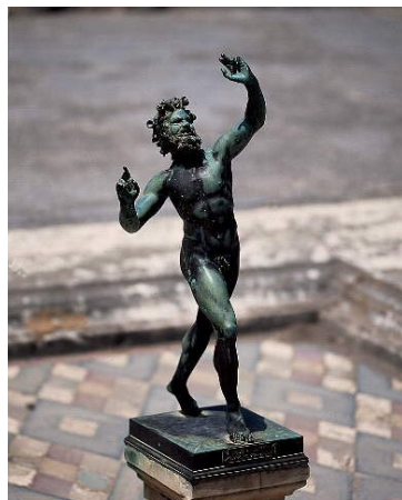
House of the Faun